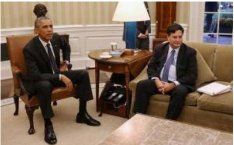
President Obama talks with reporters after a meeting with Ebola Response Coordinator Ron Klain, right, and other health and safety advisers in the Oval Office at the White House last week.

Probably the most direct analogy we have for this within U.S. politics is the outbreak of the Spanish Flu in 1918-19. Of course, in terms of sheer numbers, that was nothing like the current Ebola scare. The Spanish Flu killed half a million people