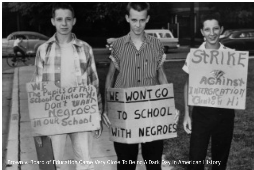
Brown v. Board of Education Came Very Close To Being A Dark Day In American History