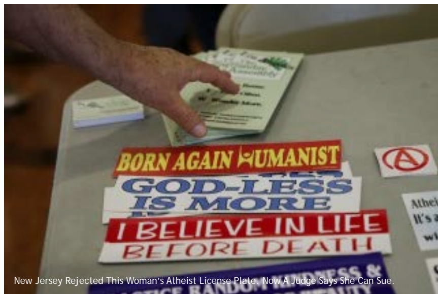
New Jersey Rejected This Woman's Atheist License Plate. Now A Judge Says She Can Sue.