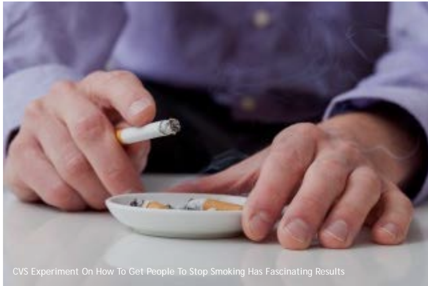
CVS Experiment On How To Get People To Stop Smoking Has Fascinating Results